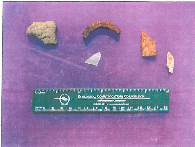
Figure 19. Artifacts from 10-20 cm in Shovel Test RF6.

from a medium sized animal (probably a pig) all in the upper 10 centimeters of the test (Figure 18). Between 10 and 20 centimeters below ground surface, investigators retrieved three pieces of cut bone, another light bulb sherd, and a piece of concrete (Figure 19). While some of this material, such as the pottery, bone, or even the light bulb glass could exceed 50 years in age, the time span represented by these items is potentially quite