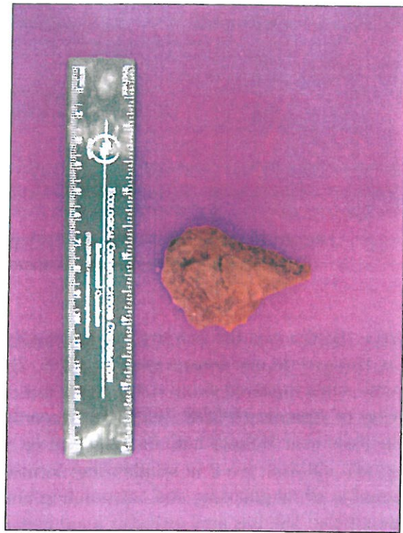
Figure 21. Unifacial tool found in Shovel Test RF20.

Surface visibility is almost zero percent due to fallen leaves, branches, and vines that are strewn across the site. Consequently, there are no obvious manifestations of a site area on the surface, except for some large loosely scattered limestone cobbles which investigators initially thought were natural surface cobbles (Figure 23). Surface cobbles are generally abundant throughout the project area. Closer inspection of the scattered rocks noted that some appeared to be burned and that they form a very low, roughly circular mound approximately 10 meters in diameter. Investigators placed seven more tests around RF20 and around the scatter of rocks, and four of the tests contained lithic material in very low density.