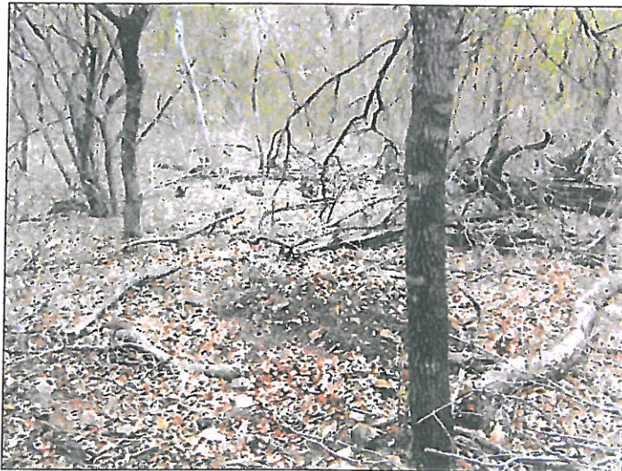
Figure 23. View of site. Note scatter of large burned cobbles on the surface.

In all but one case, bedrock was reached at 15 centimeters below surface. Recovery in RF21 included one patinated flake, recovery in RF23 included one small interior flake and an interior chert chunk, and in B35 it included a possible tested cobble. RF24 was placed within the low mound of scattered rock, and here soils extended to 30 centimeters below ground surface before reaching bedrock. The test yielded one small interior flake in the upper 10 centimeters, and another interior flake and two pieces of shatter (with cortex) in the level below that. Three tests placed farther away from the mound yielded no cultural material.