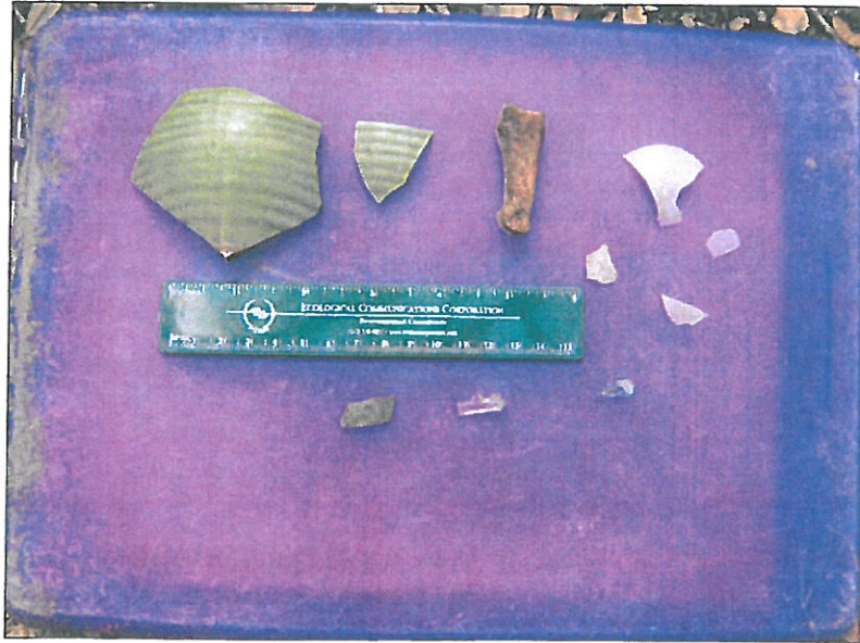
Figure 18. Artifacts from the upper 10 cm of Shovel Test RF6.

Investigators dug six shovel tests at the site. Only one of them contained any cultural material. Shovel Test RF6, placed near the southeastern end of the site, near Hausman Road, contained two conjoining pieces of a green-glazed pottery (brown on interior) vase, three shards of light bulb glass, two shards of clear glass (one a screw-top jar rim), a drywall tack (not pictured), a chert flake, and one phalange