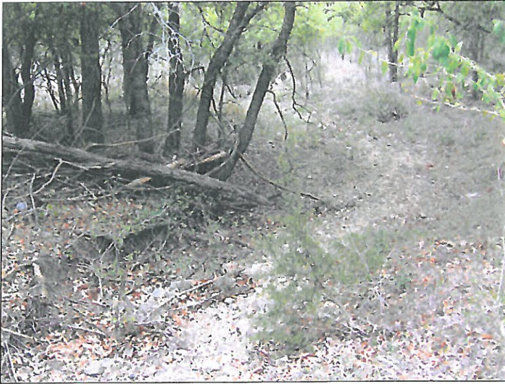
Figure 12. Tributary to Huesta Creek facing southeast.

within the brown to dark brown range (generally 10YR 6/3–10YR 3/1). The southern portion of the project, near Huesta Creek demonstrated the deepest soils; the northern portion of the project demonstrated very shallow soils and exposed bedrock in places.