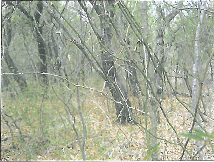
Figure 8. Dense vegetation such as this covers most of the project area.

Archeological Survey of 125 Acres along Hausman Road, Northwest San Antonio, Bexar County, Texas barn, and a chicken house—all associated with the Woller homestead—had previously been demolished (Shafer and Hester 2006). Part of the Woller property is currently being developed as park. Based on lack of integrity, the stone outbuilding is not recommended as NRHP eligible. All other development around the UTSA property has occurred within the past 30 years.