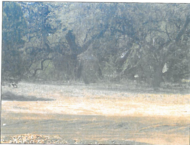
Figure 7. Stone outbuilding located on an adjacent tract south of Hausman Road.

There are no properties listed or eligible for listing on the NRHP within 1,500 feet of the