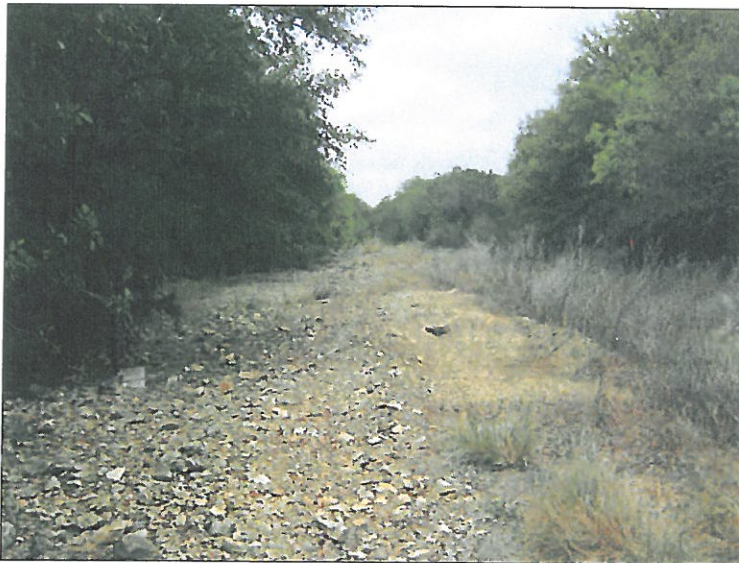
Figure 11. Huesta Creek drainage facing west

The APE slopes gently to the south, with minor variations in topography throughout. There are two primary drainages defining the 125-acre tract. Huesta Creek runs in a roughly east-