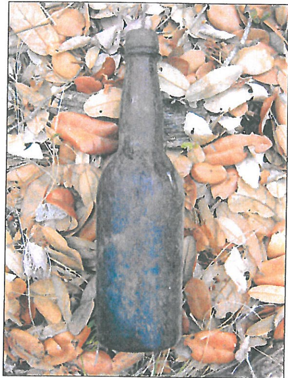
Figure 14. A nineteenth century brown glass beer bottle isolated find discovered in the northern part of the project area.

Finally, one isolated find was noted, also in the northern portion of the survey tract, close to Loop 1604. This was a brown glass beer bottle with hand applied lip (Figure 14, see also Figure 3 for location). The base bears a manufacturer's mark around the perimeter reading D S G Co, with an A in the center of the bottle. This may be a mark from the De Steiger Glass Company, which operated two plants in Iowa from 1878 to roughly 1896. De Steiger Glass Company specialized in manufacture of German style beer bottles, which could account for its presence in northwestern Bexar County, a historically German area based on a review of census records. The area around the bottle was thoroughly investigated and no features or other artifacts were observed. The bottle is spatially separated from the historic period Site 41BX1889 by more than 1,000 meters, so it is not necessarily related to that residential occupation.