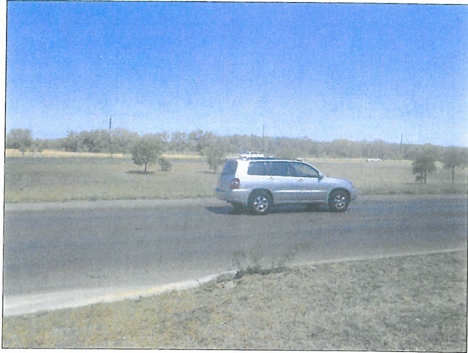
Figure 4. Typical view of the surrounding area. This photo was taken along Loop 1604 facing west from the UTSA tract.