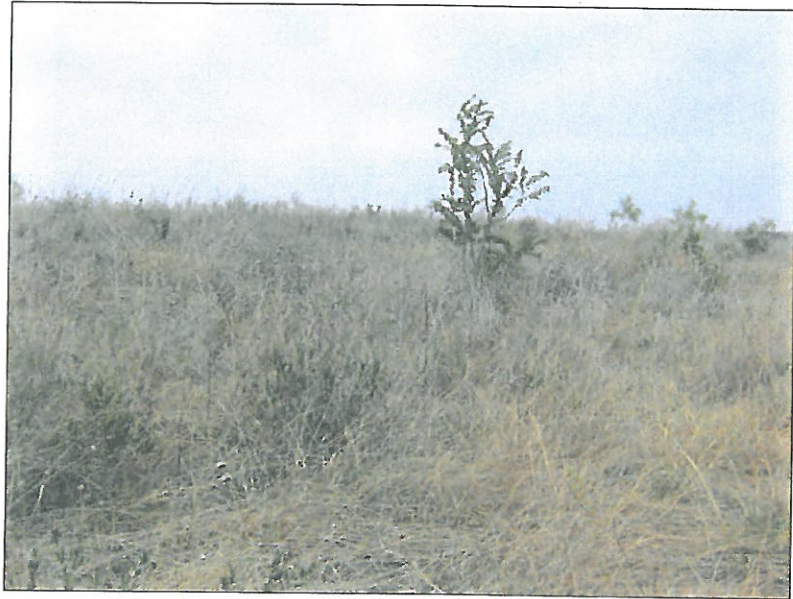
Figure 10. View of artificial landscape rise created by fill placement just south of Huesta Creek.

centimeters below ground surface. Additionally a portion of this area has been covered in recent construction fill and this too was quite evident both through visual inspection ( Figure 10 ), and shovel tests that revealed loose stony soils mixed with small chunks of concrete and modern debris. Therefore, investigators abandoned further shovel testing in this cleared area, and all other cleared areas within the APE.