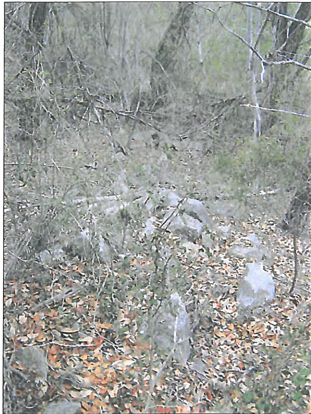
Figure 13. The rock wall forming an old property boundary in the UTSA tract.

Soils throughout the APE were characterized by dry silty loams and silty clays that varied in depth from just five centimeters to bedrock, to 50 centimeters before reaching calcareous subsoil or loosely consolidated bedrock. Soil color in all shovel tests fell