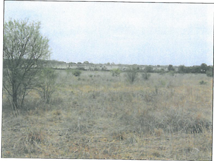
Figure 6. Housing development immediately to the east of the UTSA tract. A large drainage culvert at the edge of the tract drains water from cleared field.

The APE consists of a 125-acre tract owned by UTSA and is currently vacant of any obvious structures, save for a large drainage culvert intended to divert surface water from the tract away from an adjacent housing development (Figure 6). The tract is bounded on the south and west/north sides by busy roads (Hausman Road and Loop 1604), and on the east side by a 1980s era residential development.