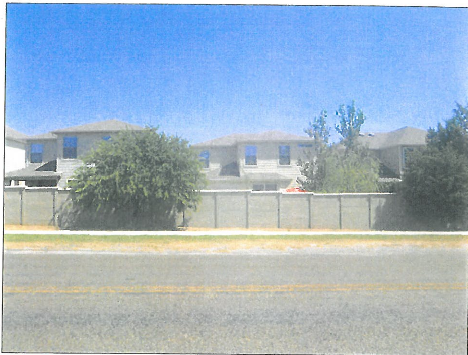
Figure 5. Typical view of residential development along Hausman Road.